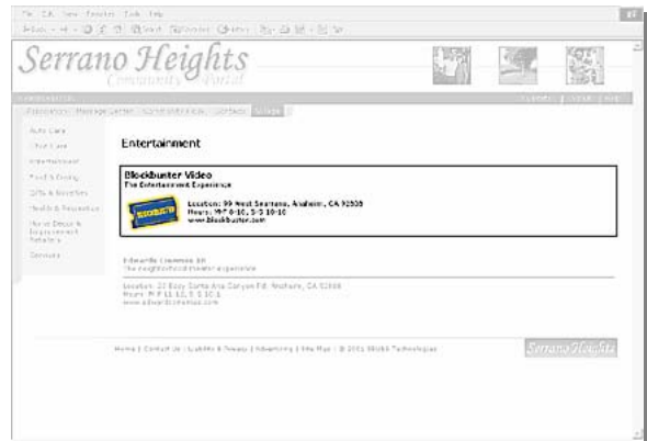
Village Category Feature Spot