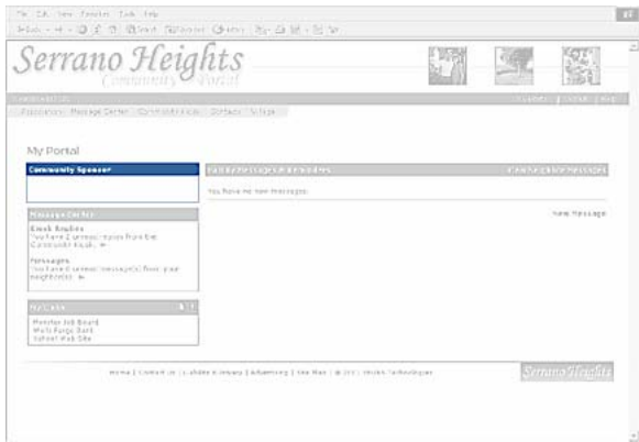
Community Sponsor Feature Spot