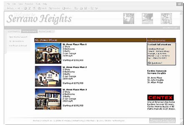
Listing Plans by Tract Name (includes coding and design)