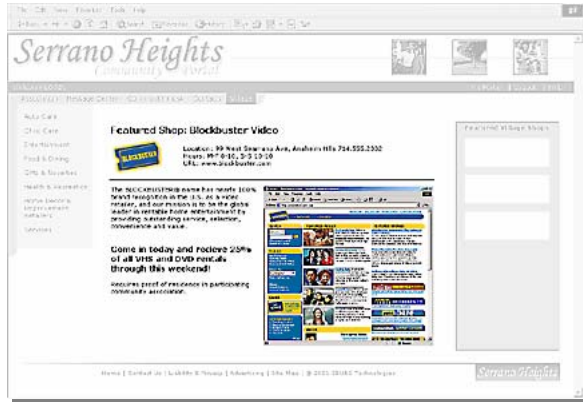
Featured Village Shop Spot – Village Home Page