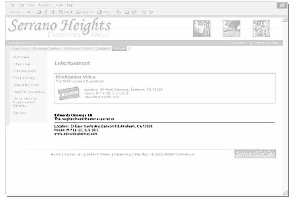
Listing in Village Category