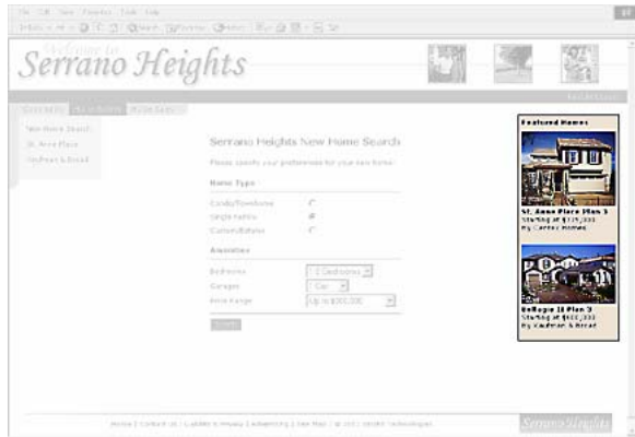
Search Page Feature Spot