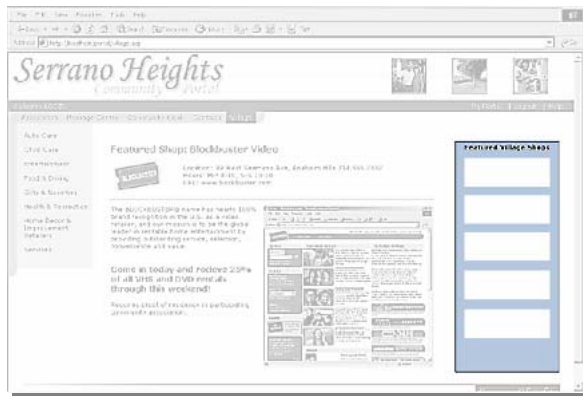
Featured Village Shops Spots – Village Home Page