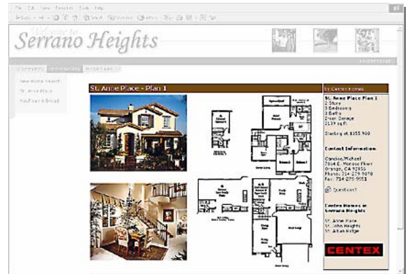
Model Plan Detail Page (includes coding and design)