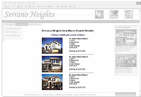
Inclusion into New Home Search – Per Tract